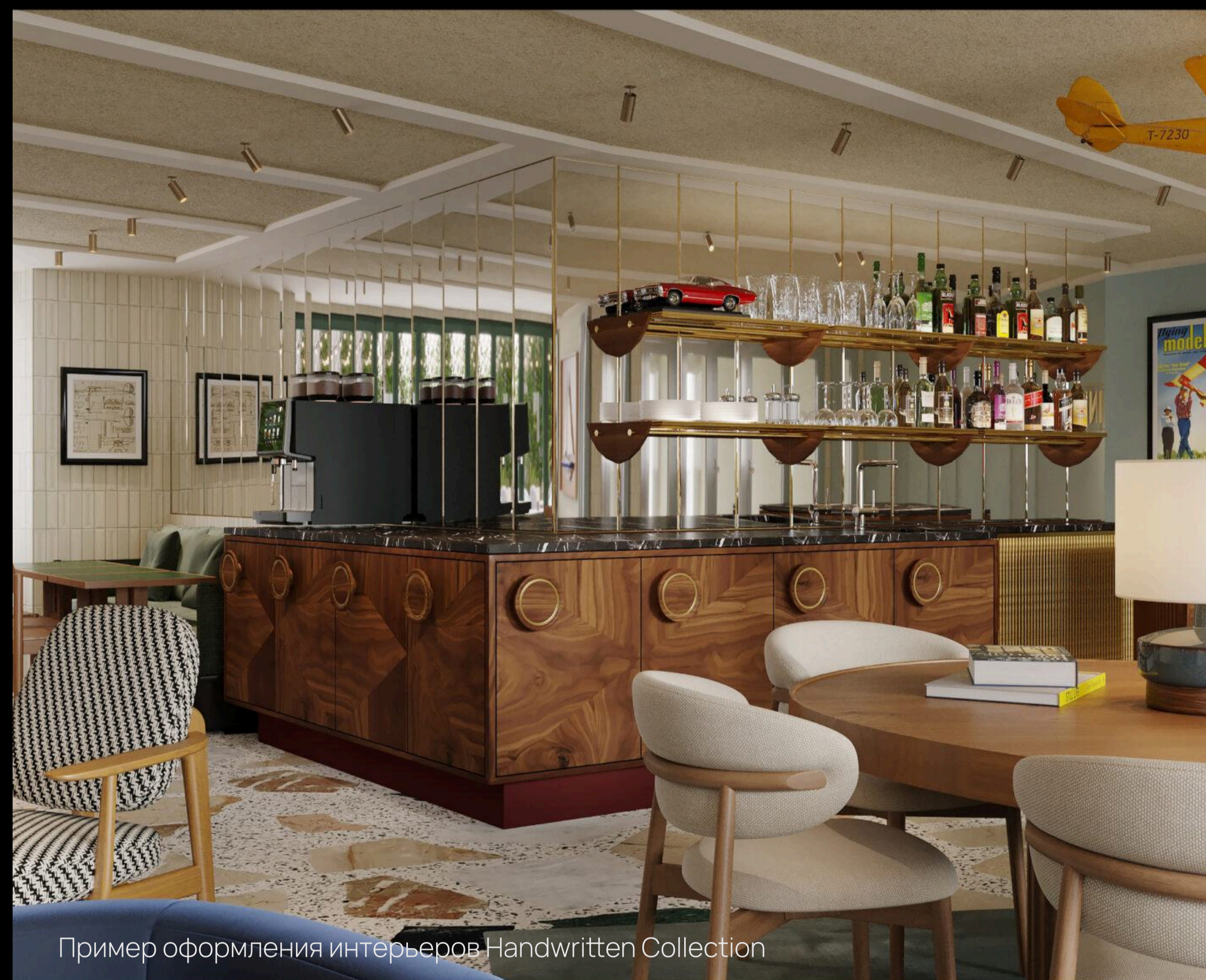
Пример оформления интерьеров Handwritten Collection

Thanks to its favorable location, you can reach Batumi's finest restaurants and entertainment venues within just 5 minutes.